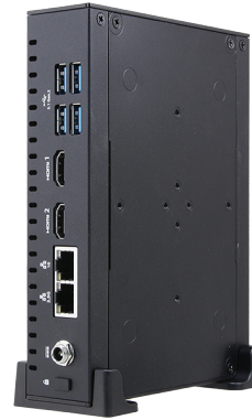
Back view with table stand kit.