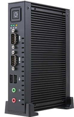
Front view with table stand kit.