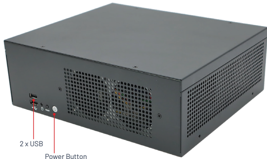
2 x USB Power Button