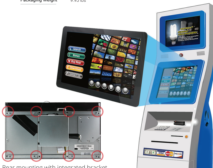
Rear mounting with integrated bracket designed for easy installation with screws.

* All product specifications and images are subject to change without notice. Last update: 1/4/2017